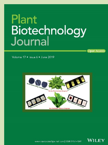
Plant Biotechnology Journal Vol. 17 Iss. 6 June 2019