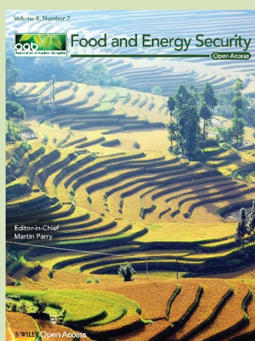
Food and Energy Security Vol. 8 Iss. 2 May 2019