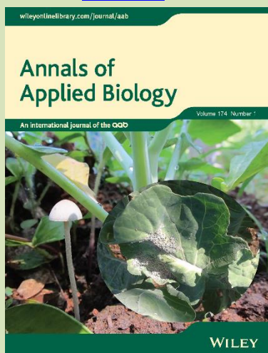
Annals of Applied Biology Vol. 174 Iss. 1 January 2019

Click on the links below to view the latest issues of 2 of our scientific journals. Please note that it is only the January issue of our Annals of Applied Biology that is open access. Remember that you will need an annual subscription to view previous and following issues so please contact Hussein in the AAB Office if you are interested!